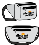
Clear Plastic Fanny Pack