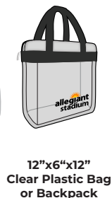
12"x6"x12" Clear Plastic Bag or Backpack