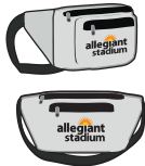
Clear Plastic Fanny Pack