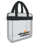
12"x6"x12" Clear Plastic Bag or Backpack